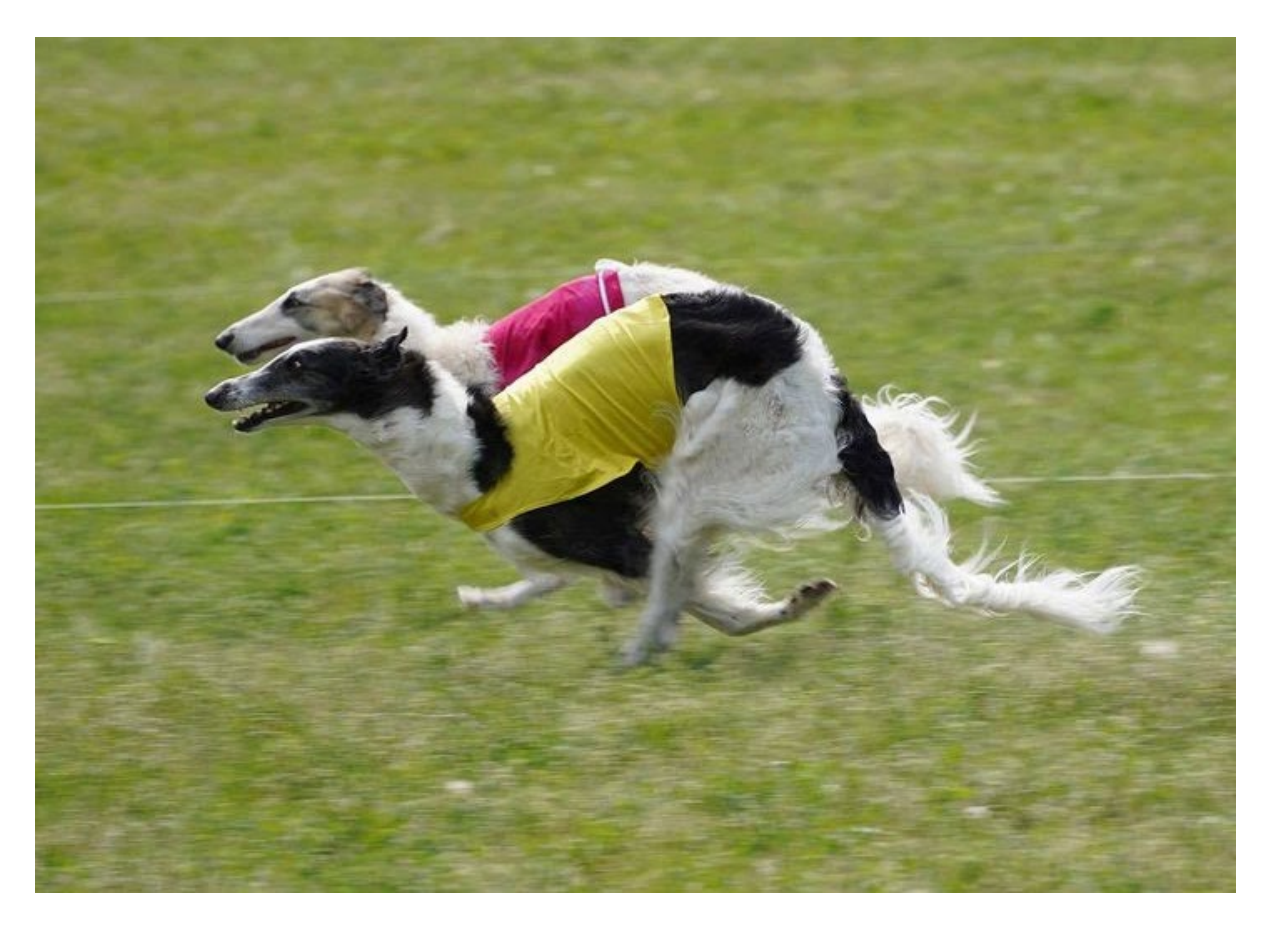
We had an AKC dog race here at the ranch over Father's Day weekend! Look at them go!