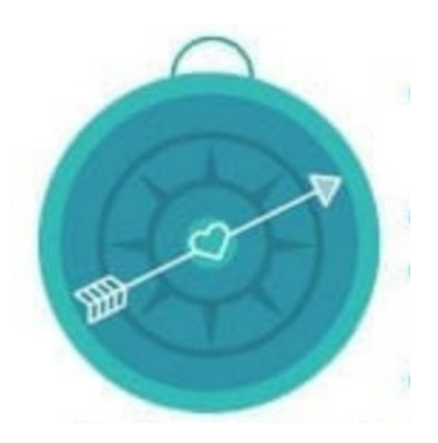
Aug 12 - 18, 2021

Do you long for life to change but keep getting tangled up when you try?