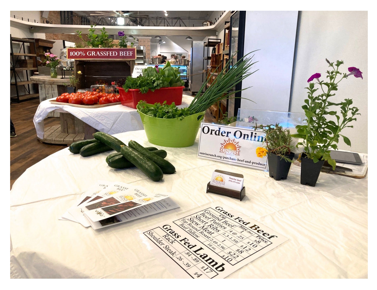
Soon, we will also be selling our produce and beef at Sweetheart City General Store on 4th street in Loveland.

Sundays 9 a.m. - 1 p.m 700 West Railroad Ave. Loveland, CO