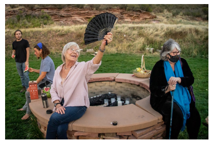
The Ranch had a community event September 19 called Celestial Bodies in Motion . It included aerial "prayerformances," stargazing and storytelling.