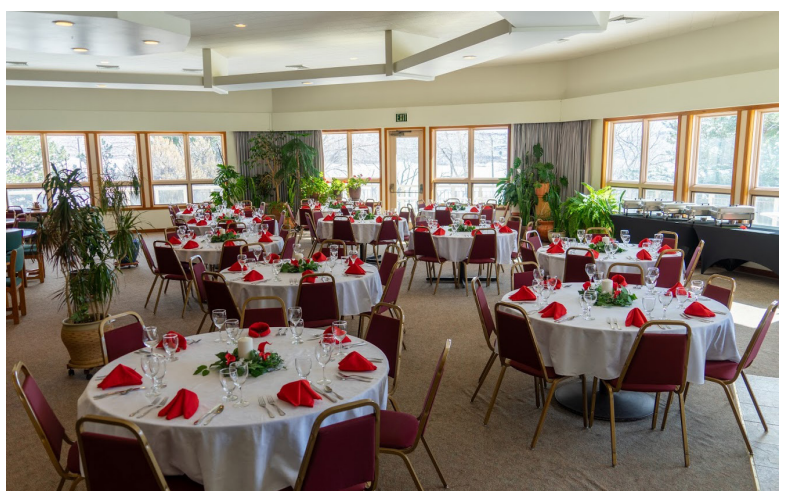
Tables set up for the Valentine's Day Lunch