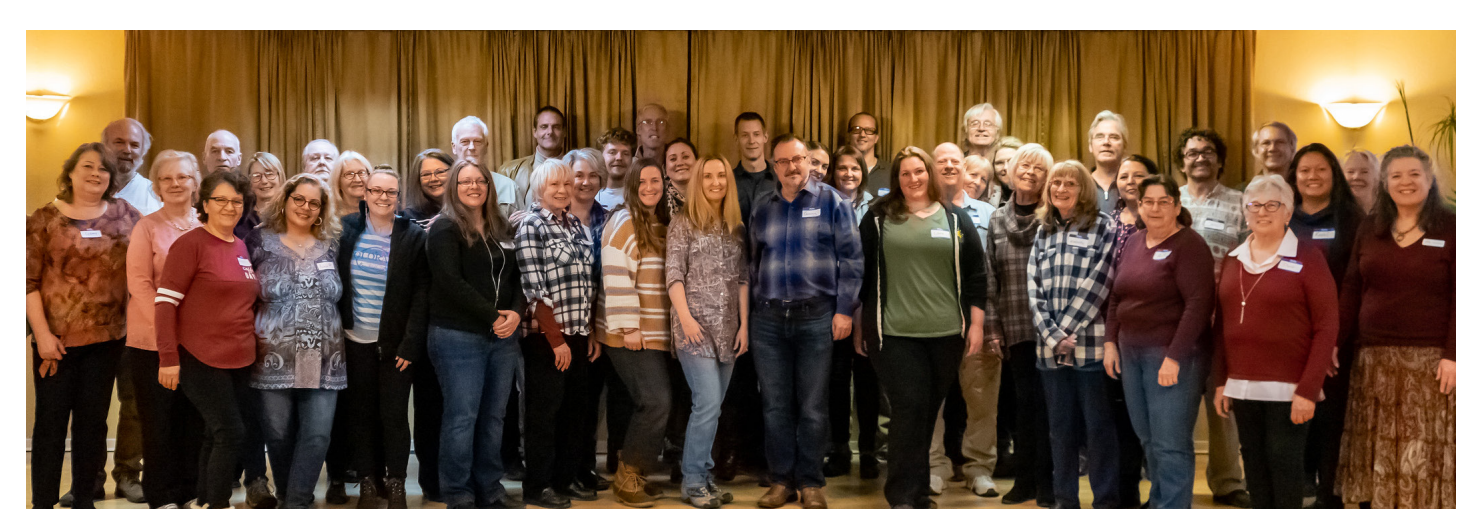
The participants in the Introduction to Attunement on February 29, 2020

We've also been developing a new website, Global Emergence, which will have an online learning platform.