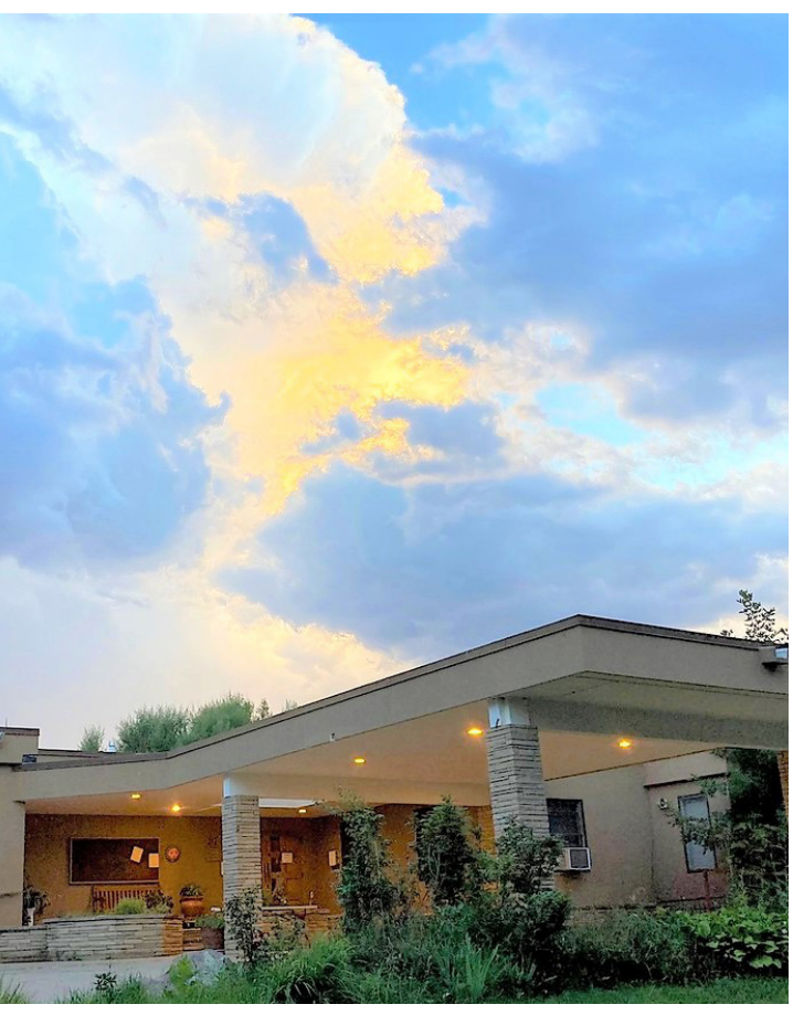
Sunrise Ranch Pavilion under a beautiful summer sky