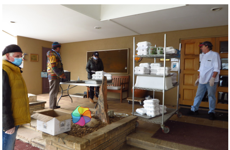
Preparing for food deliveries March - June

In addition, our amazing kitchen staff continued to prepare excellent meals and grocery orders, which community volunteers delivered to each resident on a daily basis through June. In July, we implemented a new system for enjoying meals together, under a tent behind the Pavilion. Sunrise Ranch residents continue to maintain strict social distancing measures. We consider ourselves fortunate since we are relatively isolated and have the added bonus of thousands of acres of beautiful wilderness in which to play, walk and meditate. No one can foresee how this will end but we do know that we will meet any eventuality with grace and aplomb together.