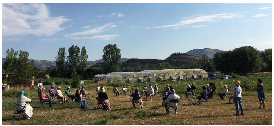
In August, the community began meeting four days a week for a morning prayer