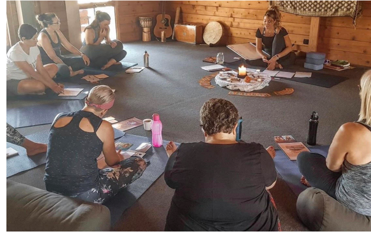
Yoga class at Riverdell before COVID-19 necessitated offering online classes