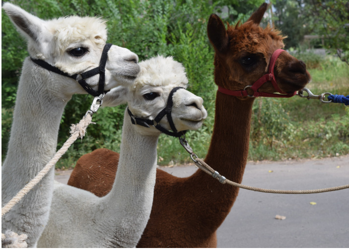
The first quarter of 2020 at Sunrise Ranch was cold and snowy, but full of new life! Our prolific flock of sheep gave us 37 new and extremely adorable lambs, protected by our 3 guardian-uncle alpacas. Our herd of 24 mama ewes, protected by Mama Llama, will expand to 30 before next lambing season.

The Sunrise Ranch cattle have spent the winter and early spring rotating from pasture to pasture. Our horses, Scotch and Sammy, have been busy moving cows and chasing the yearlings when they are naughty and escape. Our awesome farm team continues to heroically deliver hay to both the cows and the now-weaned calves twice a day through all kinds of weather. Our herd grew from 29 to 46 after last year's calving season. Our 100 baby chicks are now laying their own eggs!