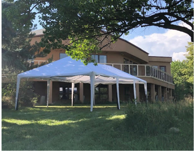
Our new meal tent behind the Pavilion