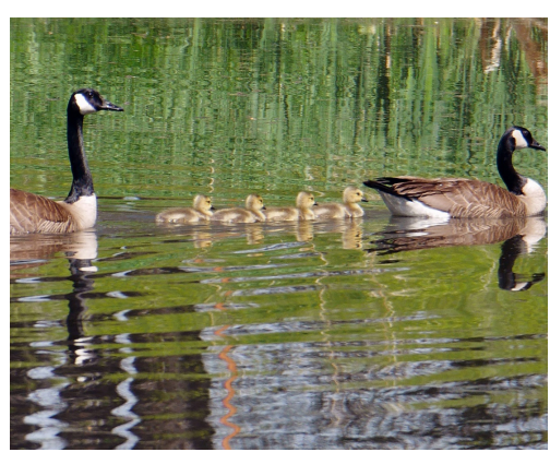
A new family joined us after the winter thaw!