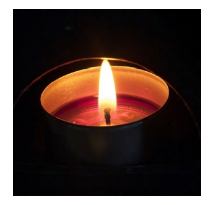
December 29, 2019 - January 2, 2020

Coming Home to the Core of Your Being with Amoda Maa