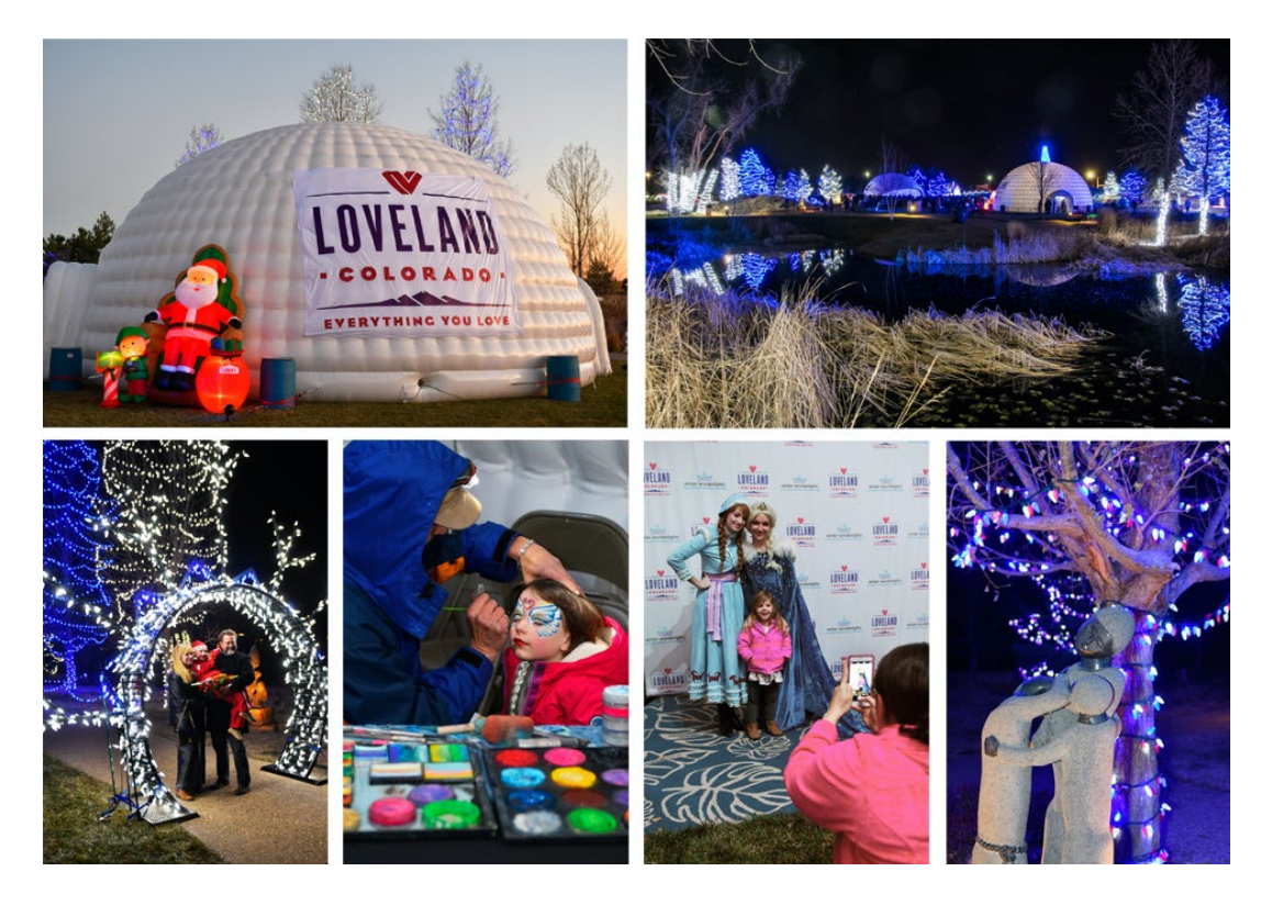
Join us at Winter Wonderlights in Chapungu Sculpture Park on Saturday, December 13 & 14. In our igloo, we will have free holiday cookie painting and chocolate fountain treats!