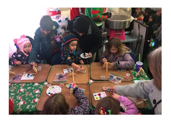
Sunrise hosted a booth during the Winter Wonderlights celebration December 13 and 14 in Loveland, offering cookie painting, chocolate fondue and hot chocolate.