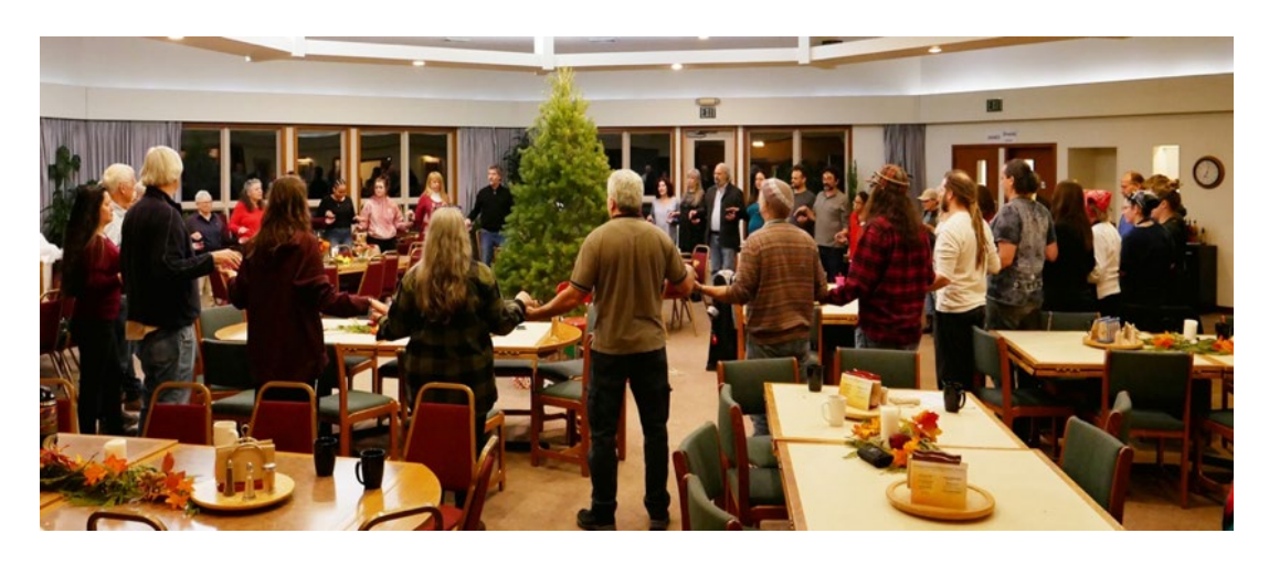
Sunrise Ranch residents gather in a circle just before decorating the Christmas tree and the Pavilion on December 4, 2019.