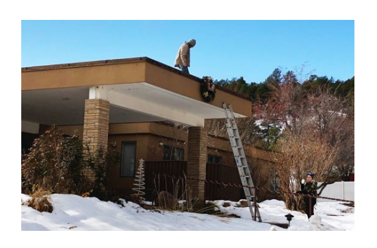
Bryan hangs a wreath from the Pavilion roof while Ashley offers support on December 7.