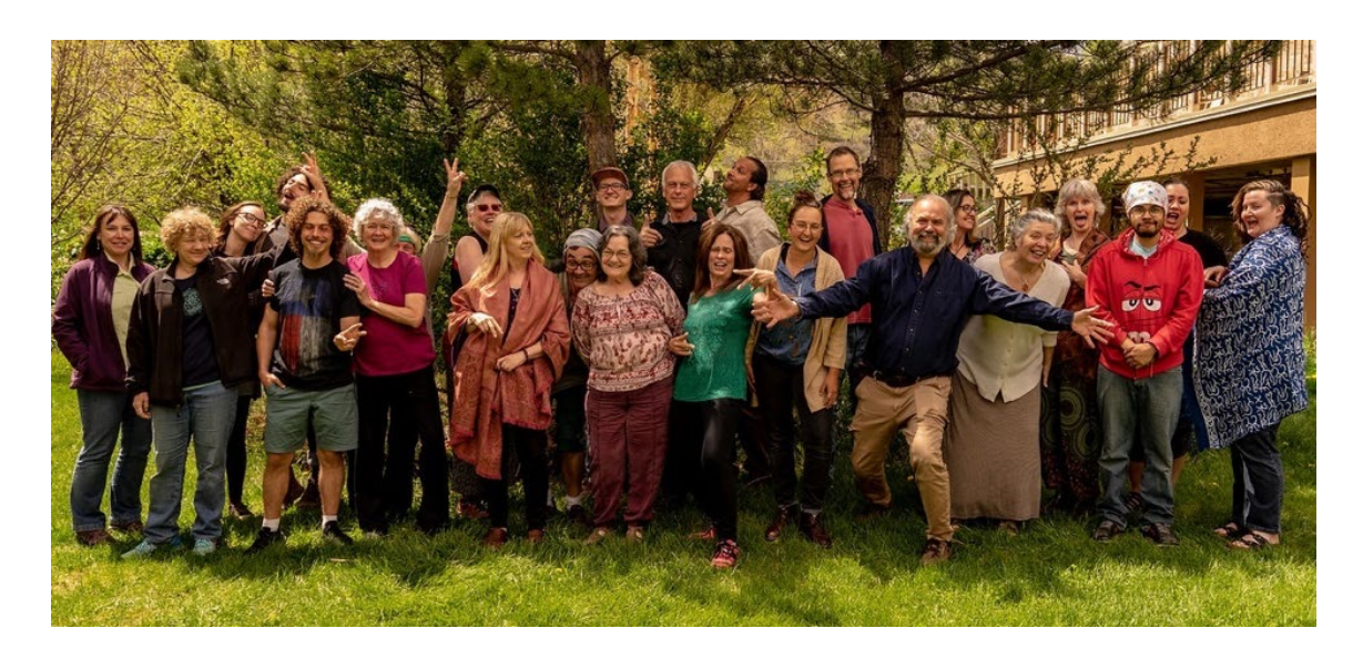
Sunrise Ranch has openings, including an opening for the Homekeeper to help in our Accommodations Building and other areas around the Ranch.

Know of a good fit? Please let them know about us!