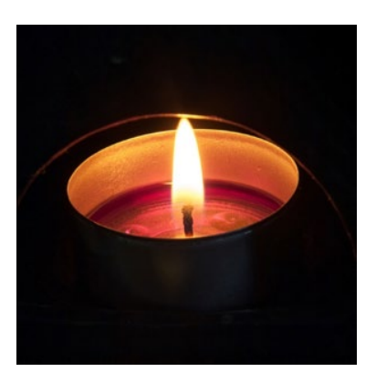
December 29, 2019 - January 2, 2020

This retreat is an invitation to discover your deepest longing to "come home" and to fall open into the core of being. Held in a container of loving inquiry, you will be supported in bringing to light everything that stands in the way of your true radiant nature as this beingness. Through tender yet unwavering honesty, you will be invited to bring your brokenness, your vulnerability, and your wildness, right here into the present moment, to simply be with whatever arises, and to hold it in the bowl of unconditional acceptance. Together we will