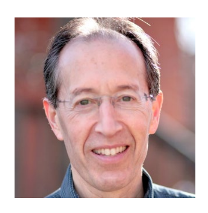
December 27 - 31, 2019

The primary focus of this retreat will be the practice of sitting and walking meditation in Noble Silence. There will be meditation instruction, dharma talks and opportunities for discussion. Using guided experiential exercises, we'll review the year that is ending and reflect upon what we've learned. At the end of the retreat, we'll set our intentions for the year to come and prepare to set them in motion on January 1st.