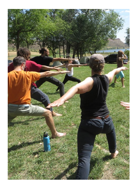
Class members in a Permaculture Design Course practice yoga on August 31.