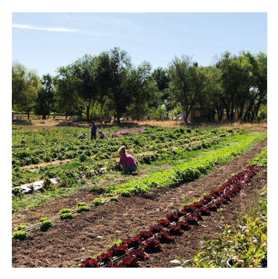
Angelica and others pick strawberries September 24. With an abundance of produce, a number of community members have been spending time helping out in the gardens and greenhouses.