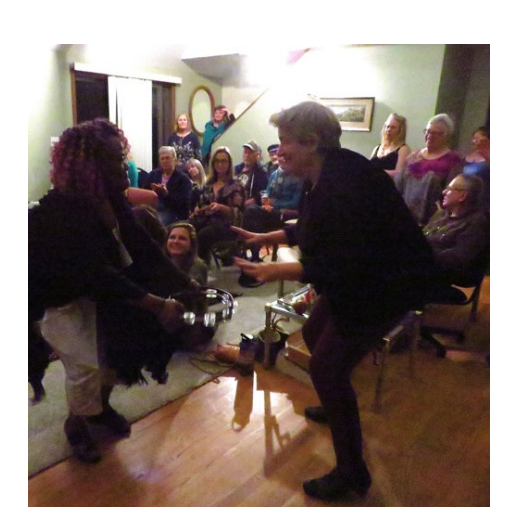
Up at the Chalet on September 29, a group of Emissary servers, trustees, and community members get together to enjoy an evening of singing, dancing, and entertainment.