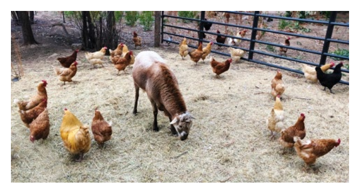
One sheep wanders over to find out what the chickens are eating on September 6.