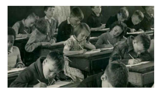
Courage: The Virtue that Unlocks All Others