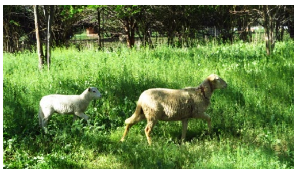
A mama and baby lamb walk in their peaceful enclosure on June 5, 2019.