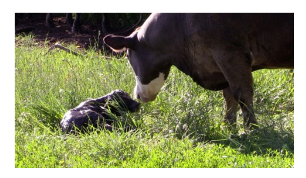
Photographer Diego Reyes arrived just after a calf was born in the pasture on June 9, 2019.